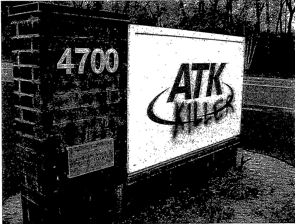
Vandalism that occurred at Alliant Techsystems (ATK) in Plymouth, Minnesota, on 7 May 2005.